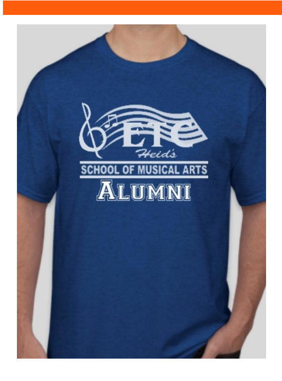
ETC Alumni Shirt Sale - $10-$12 per shirt.

We are selling alumni t-shirts! The shirts will look much like the picture above. Sales will run for a few weeks. E-mail <a href="Robert.Sabree@etcheidsschoolofmusicalarts.com">Robert.Sabree@etcheidsschoolofmusicalarts.com</a> if you are interested in purchasing a t-shirt!